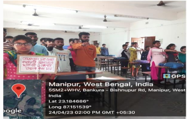
Manipur, West Bengal, India 55M2+WHV, Bankura - Bishnupur Rd, Manipur, West Bengal, India Lat 23.184686° Long 87.151539° 24/04/23 02:00 PM GMT +05:30