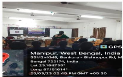
Manipur, West Bengal, India 55M2+XMB, Bankura - Bishnupur Rd, Manipur, West Bengal 722174, India Lat 23.184738° Long 87.151814° 25/03/23 02:45 PM GMT +05:30