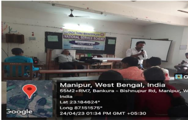
Manipur, West Bengal, India 55M2+RM7, Bankura - Bishnupur Rd, Manipur, West Bengal, India Lat 23.184624° Long 87.151575° 24/04/23 01:34 PM GMT +05:30