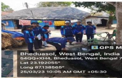
Bheduasol, West Bengal, India 54QQ+XH4, Bheduasol, West Bengal 722174, India Lat 23.192055° Long 87.138565° 25/03/23 10:05 AM GMT +05:30