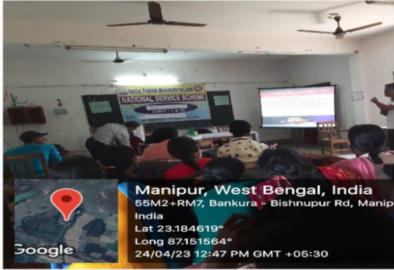
Manipur, West Bengal, India 55M2+RM7, Bankura - Bishnupur Rd, Manipur, West Bengal, India Lat 23.184619° Long 87.151564° 24/04/23 12:47 PM GMT +05:30