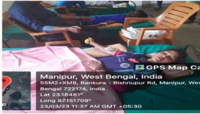
Manipur, West Bengal, India 55M2+XM8, Bankura - Bishnupur Rd, Manipur, West Bengal 722174, India Lat 23.18481° Long 87.151709° 23/03/23 11:37 AM GMT +05:30