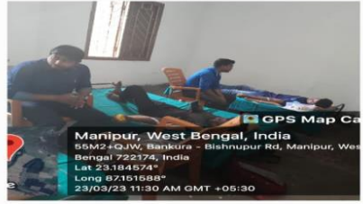
Manipur, West Bengal, India 55M2+QJW, Bankura - Bishnupur Rd, Manipur, West Bengal 722174, India Lat 23.184574° Long 87.151688° 23/03/23 11:30 AM GMT +05:30