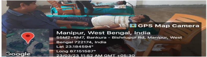
Manipur, West Bengal, India 55M2+RM7, Bankura - Bishnupur Rd, Manipur, West Bengal 722174, India Lat 23.184594° Long 87.151587° 23/03/23 11:52 AM GMT +05:30