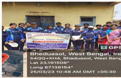
Bheduasol, West Bengal, India 54QQ+XH4, Bheduasol, West Bengal 722174, India Lat 23.191508° Long 87.138154° 25/03/23 10:48 AM GMT +05:30