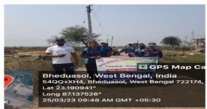
Bheduasol, West Bengal, India 54QQ+XH4, Bheduasol, West Bengal 722174, India Lat 23.190941° Long 87.137526° 25/03/23 09:48 AM GMT +05:30