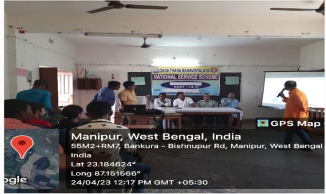
Manipur, West Bengal, India 55M2+RM7, Bankura - Bishnupur Rd, Manipur, West Bengal, India Lat 23.184624° Long 87.151568° 24/04/23 12:17 PM GMT +05:30