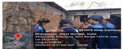
Bheduasol, West Bengal, India 54QQ+XH4, Bheduasol, West Bengal 722174, India Lat 23.191811° Long 87.138554° 25/03/23 10:01 AM GMT +05:30