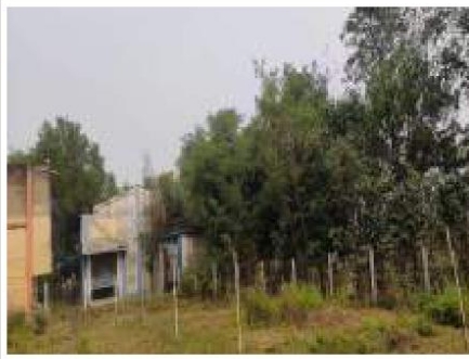
Greenery of College