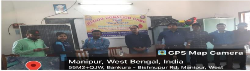
Manipur, West Bengal, India 55M2+QJW, Bankura - Bishnupur Rd, Manipur, West Bengal 722174, India Lat 23.184574° Long 87.151688° 23/03/23 11:30 AM GMT +05:30