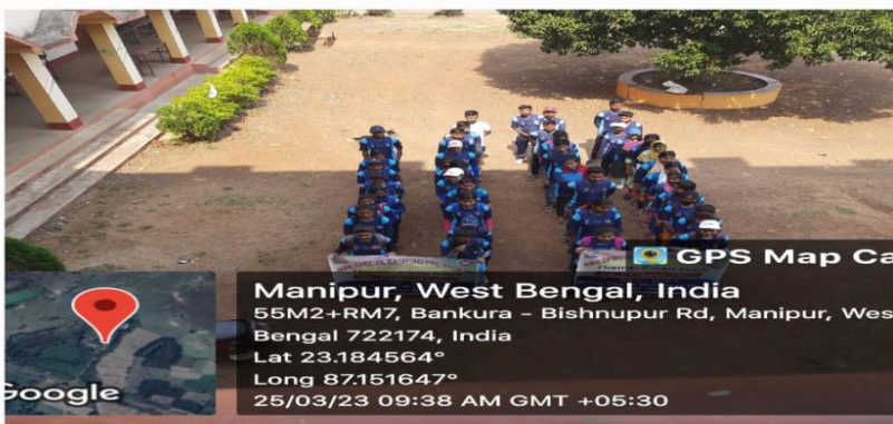
Manipur, West Bengal, India 55M2+RM7, Bankura - Bishnupur Rd, Manipur, West Bengal 722174, India Lat 23.184564° Long 87.151647° 25/03/23 09:38 AM GMT +05:30